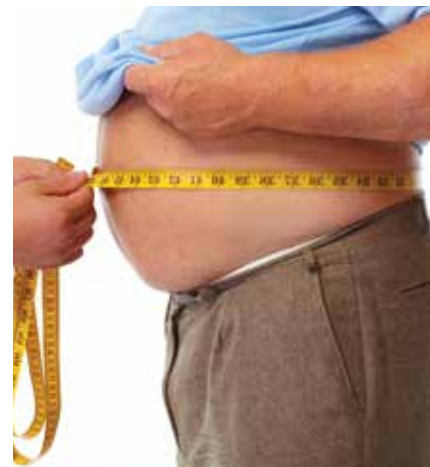
Figure 1. Assessment of abdominal obesity by waist circumference measurement is recommended for all patients with COPD.

Obese patients are more breathless than nonobese patients for various reasons. An increased work of breathing is present, related to an increased respiratory muscle workload due to decreased lung compliance, especially in patients with abdominal obesity. van de Boel and colleagues describe abdominal obesity and an elevated abdominal visceral fat mass, independent of BMI, contributing to increased cardiovascular risk and determining COPD outcome. 16 There is also impaired gas exchange secondary to microatelectasis. More recent studies report that obese patients are more susceptible to